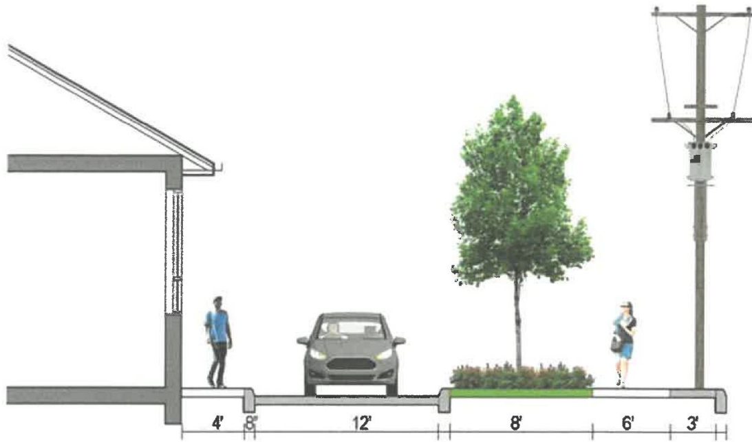
Figure 3. Cross-section of 35-foot commercial setback