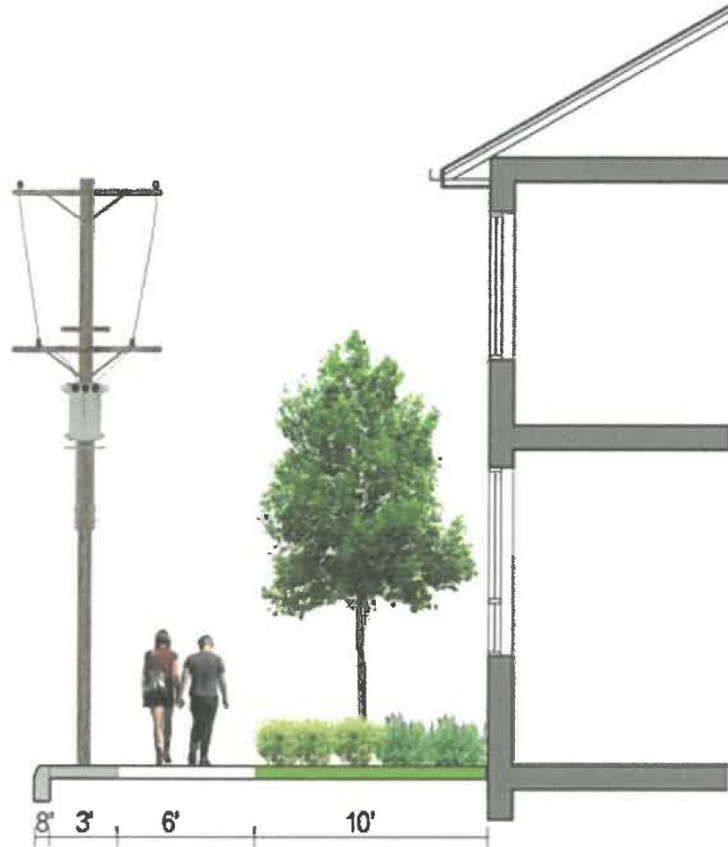
Figure 1. Cross section of 20-foot commercial setback