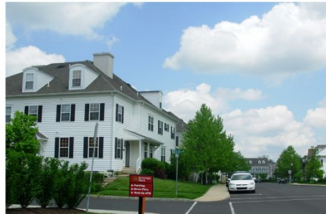
Larger Manor House, Lantern Hill TND