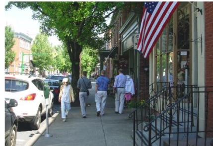
Generously proportioned Sidewalk in Lititz, PA