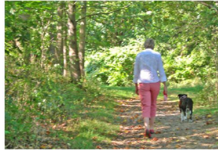
An informal trail through Open Space