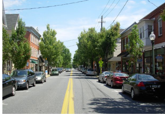
Parked vehicles buffer pedestrians from vehicular traffic in Litz, PA