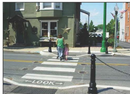
Crosswalk in Lititz