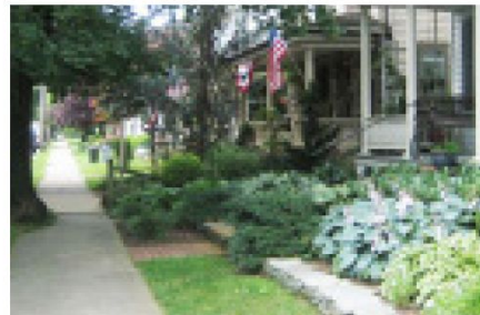
Street Wall created by aligned homes Lititz, PA