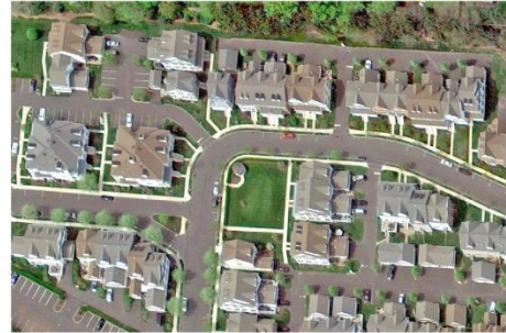
Intermingled Dwelling Units, Lantern Hill TND