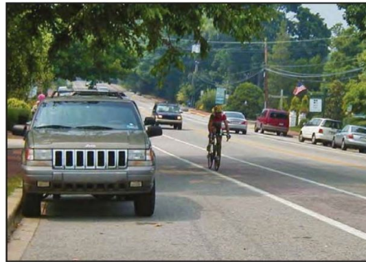
Curbside , parallel, On-Street Parking, separated from the travel lanes by a bicycle lane. Centreville, DE.