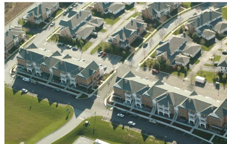
Mixed-use "Live-Work" buildings in Uwchlan Twp, PA