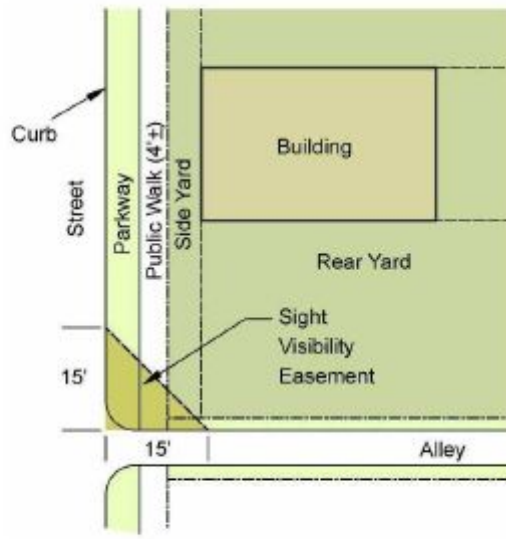
Intersection of Public Street and Alleyway

(Ordinance 1927, sec. 10, adopted 9/9/13)