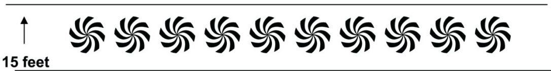
BUFFER AREA "C"