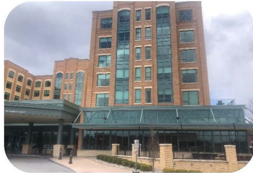
Six-story hotel and restaurant with brick and glass facade.