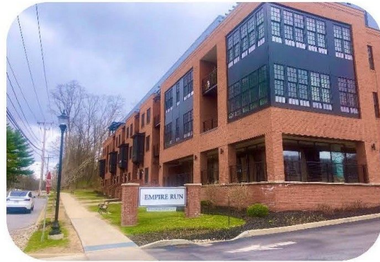
Three story building with residential, commercial and retail uses. Building facade with brick, metal and glass materials.