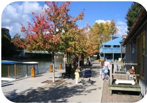
Promenade and buildings providing continuity of interest and human-scale landscape elements.