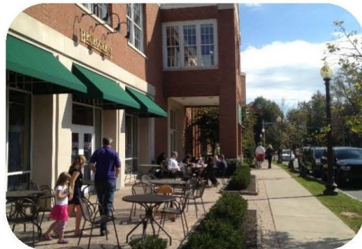
Two story brick building with civic and retail uses.