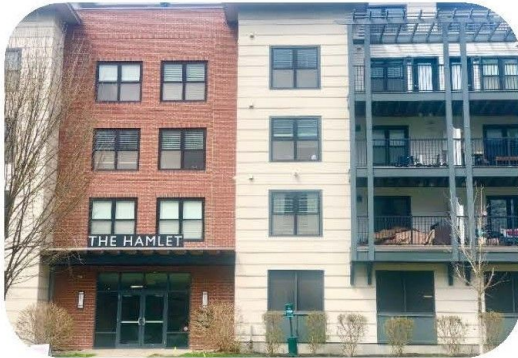
Four story plus penthouse mixed use building.