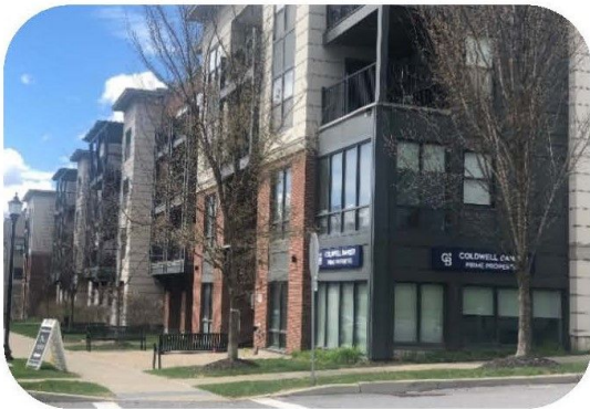
Four story mixed use building with brick, glass, metal and masonry.