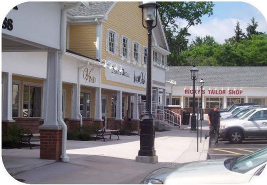
One and two story commercial and retail.