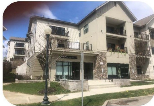
Three story mixed use building.