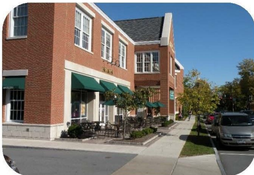
Two story civic and commercial building with brick and colonial style architecture.