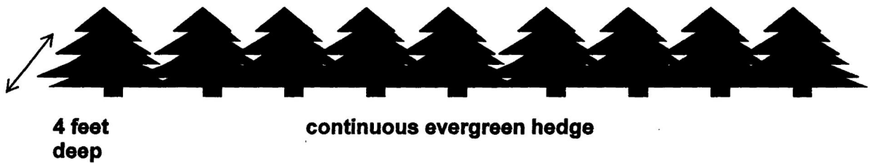
BUFFER AREA "B"