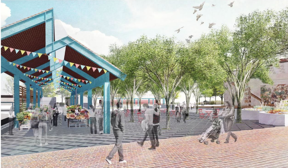
Figure 25: Examples of Pedestrian Pockets