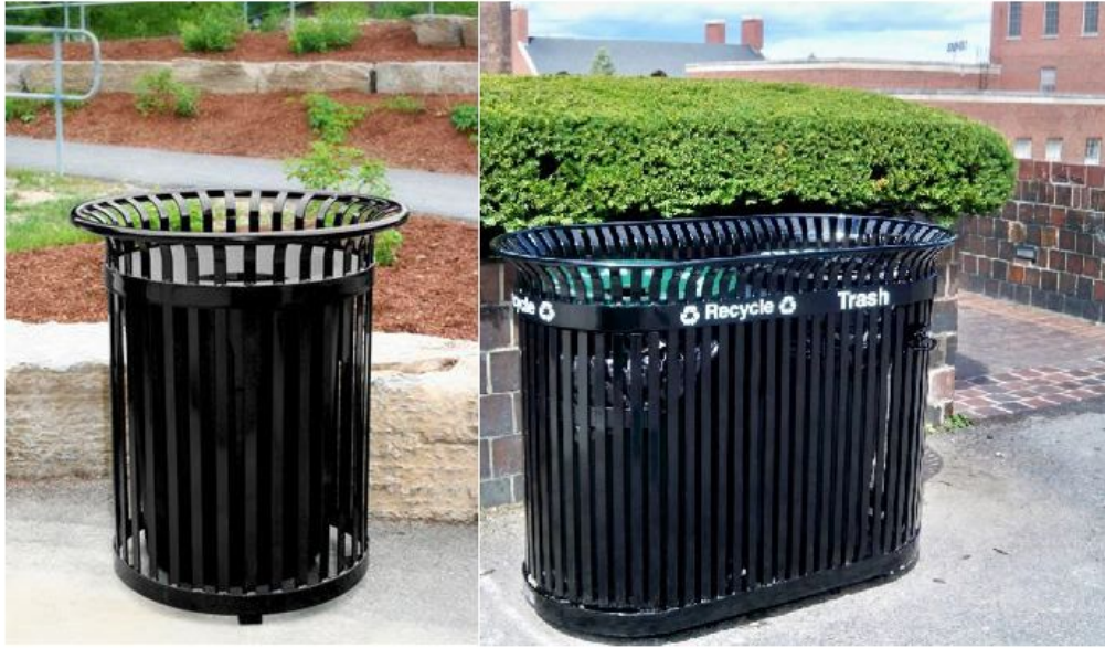
Figure 19: Examples of Trash Receptacles