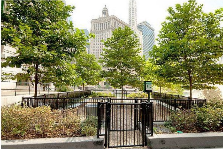
Figure 24: Examples of Pet Pockets