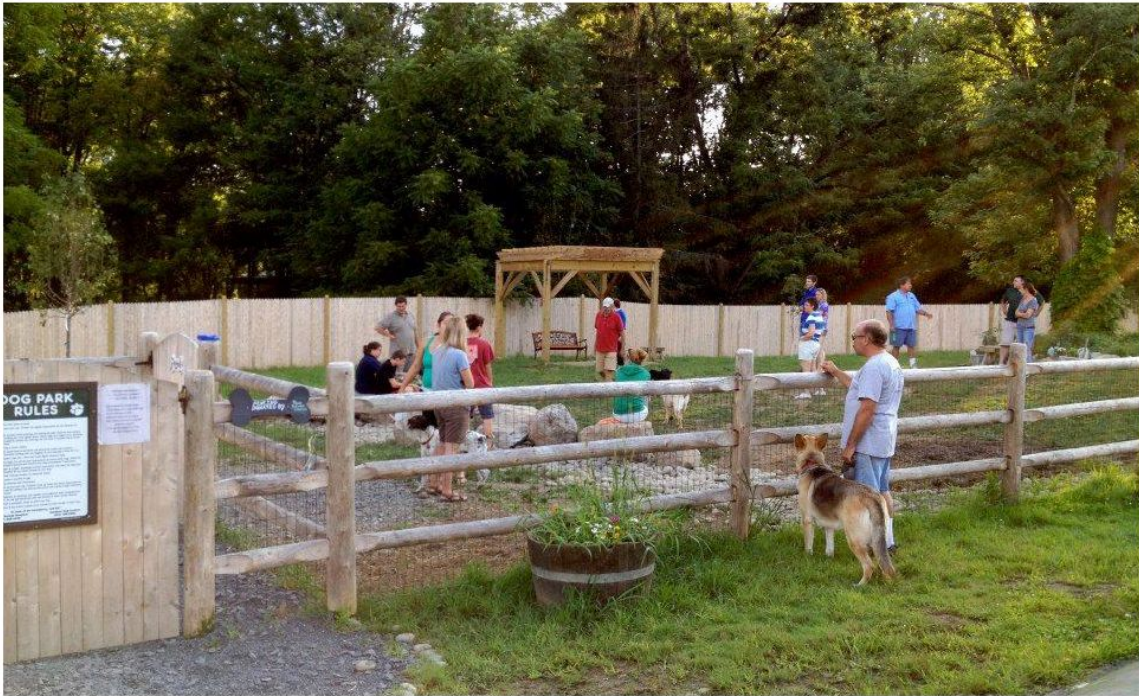
Figure 23: Examples of Dog Parks