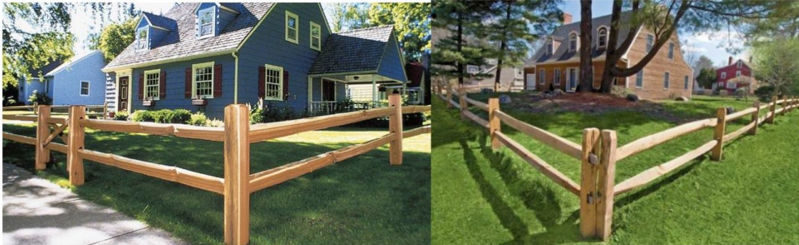
Figure 26: Examples of Fencing