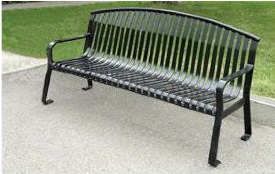
Figure 20: Examples of Street Furniture