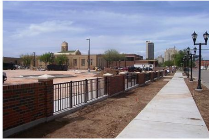
Figure 27: Examples of Street Walls