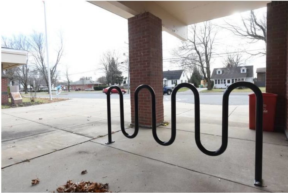
Figure 21: Examples of Bicycle Racks