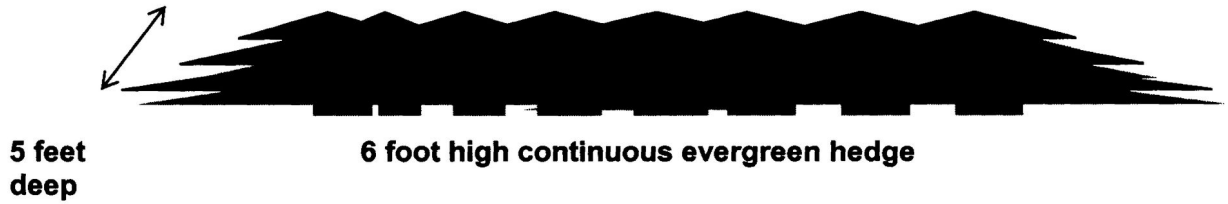
6 foot high continuous evergreen hedge