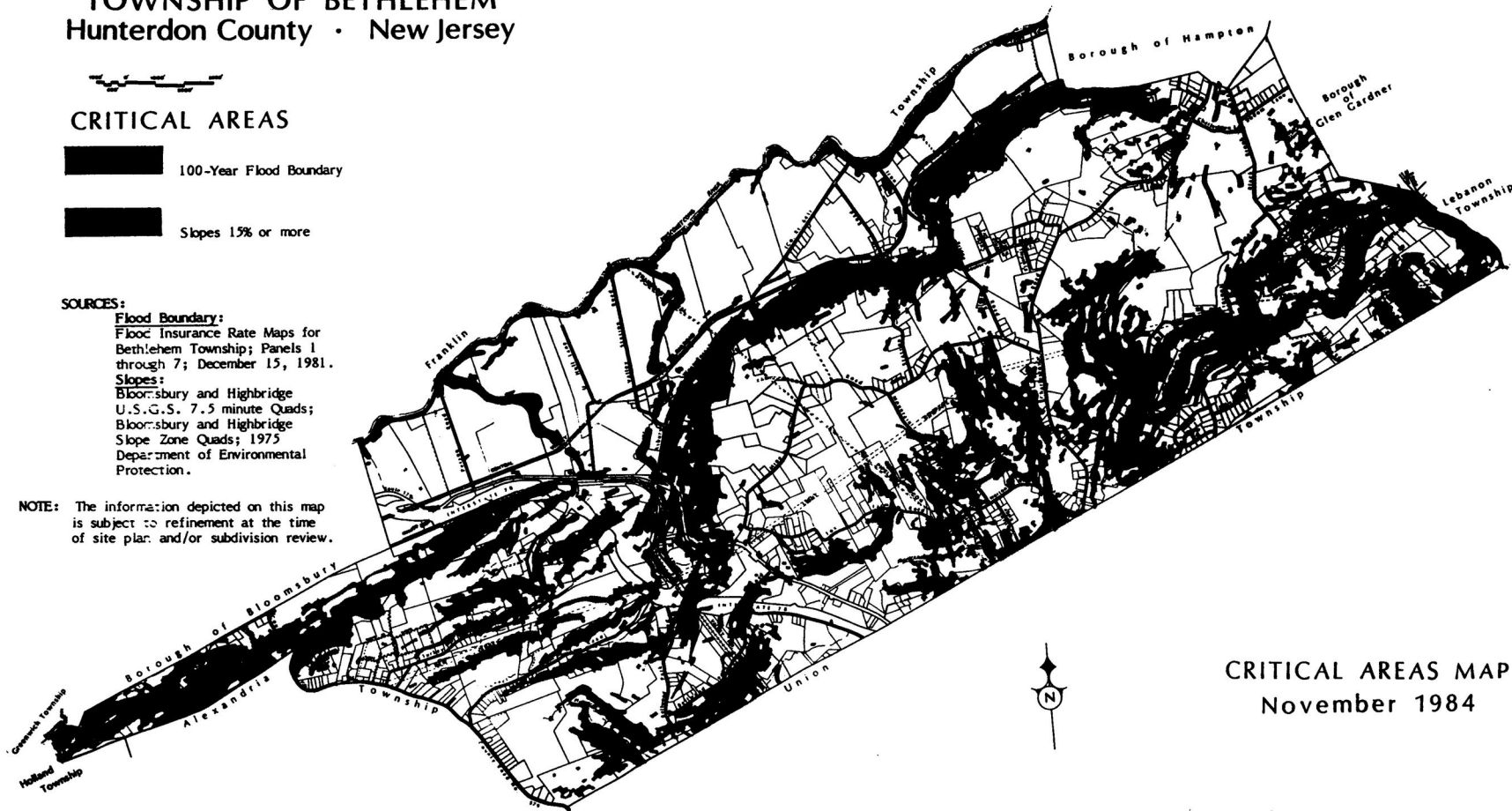
CRITICAL AREAS MAP November 1984

NOTE: The information depicted on this map is subject to refinement at the time of site plan and/or subdivision review.